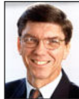
Clayton M. Christensen

Clayton M. Christensen, the book's lead author and a business professor at Harvard University, is well respected in the business world for his best-sellers The Innovator's Dilemma , published in 1997, and The Innovator's Solution , published in 2003.